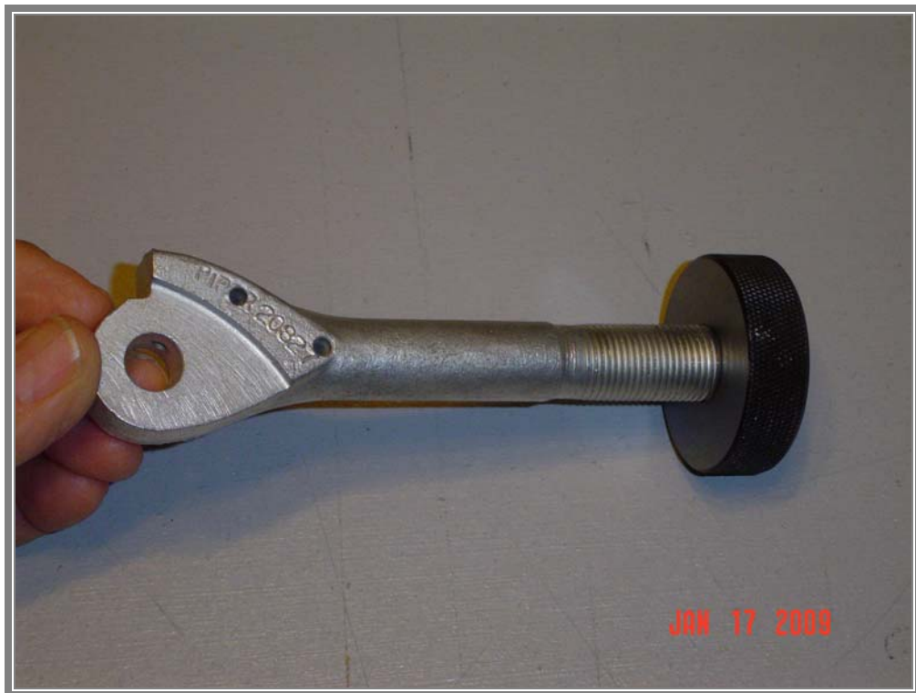
MAIN GEAR SIDE BRACE LINK AND THREAD RING GAUGE; WITHIN THE LIMIT. READ #3-B ON THE FIRST PAGE.