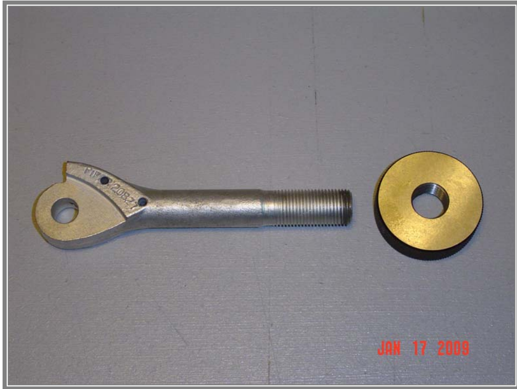
MAIN GEAR SIDE BRACE LINK AND THREAD RING GAUGE.